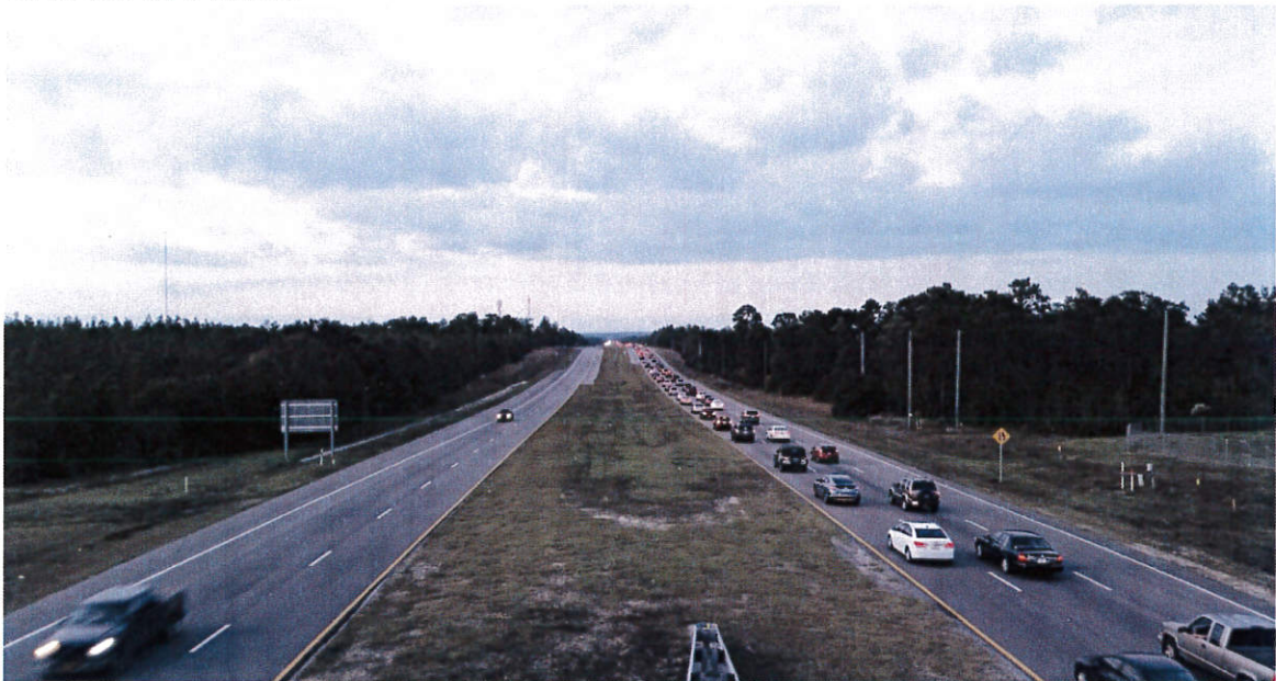
View looking north on SR 85 from Duke Field Interchange at 4:30 PM

A Bypass is needed around Crestview to divert traffic from State Route (SR) 85. The State, Okaloosa County, and the City of Crestview have been working on the Western Crestview Bypass to relieve congestion on SR 85. SR 85 is a Strategic Intermodal System roadway and is a primary commuter route to military bases and tourist destinations. Monday through Friday, SR 85 backs up from I-10 to Duke Field; a distance of 6 miles.