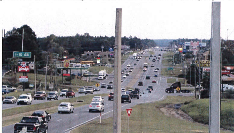
SR 85 looking south from I-10

Currently, residents west of Crestview must travel on P.J. Adams Parkway and cross I-10 twice to access the businesses along SR 85 near I-10. Adding Rasberry Road will allow this local traffic to remain on City Streets, via Rasberry Road and avoid using SR 85 and P.J. Adams Parkway.