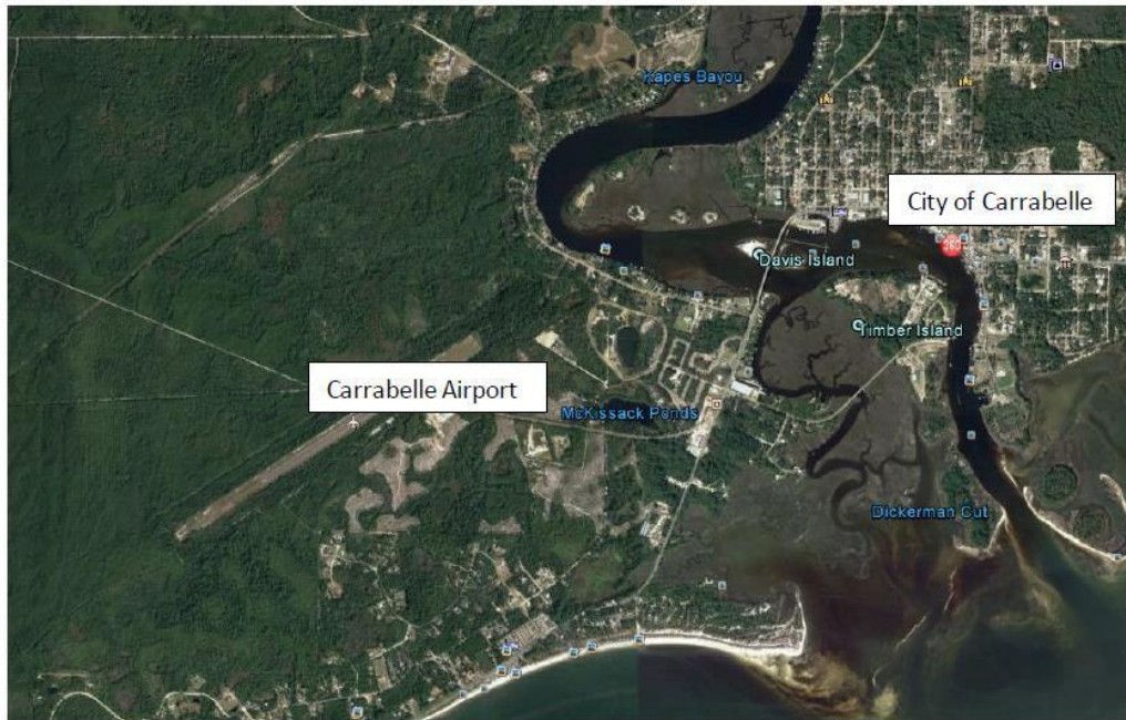
Figure 1: Proposed Project Location

Location: The proposed project is located at Carrabelle-Thompson Airport in Franklin County, Florida. The airport is located about 1.5 miles southwest of the City of Carrabelle (Figure 1). The specific project site is located in the northeast section of the airport property, in a paved area just south of runway end 23 and adjacent to existing hangar facilities (Figure 2).