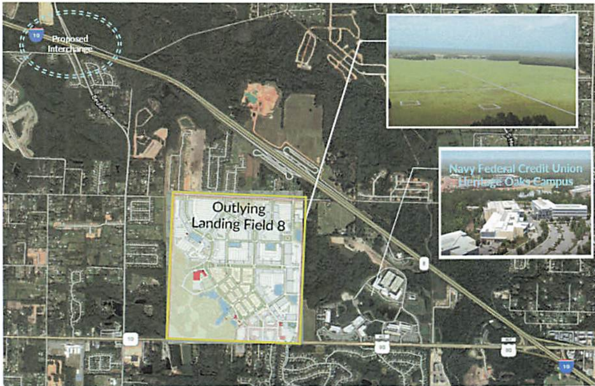
Location: OLF-8 Phase I Infrastructure (road, water, sewer) and Sapphire development project: