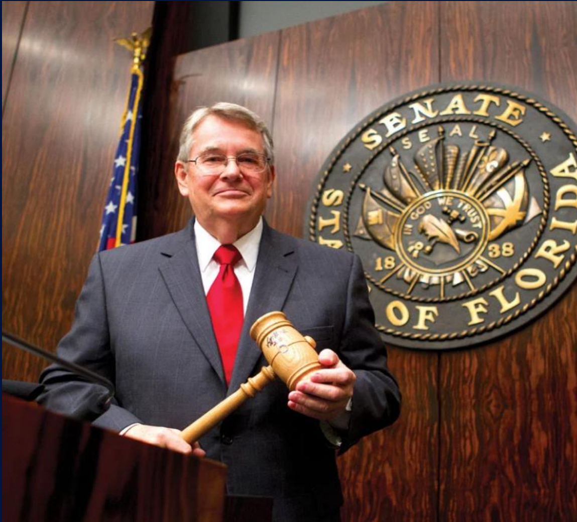
SENATOR DON GAETZ